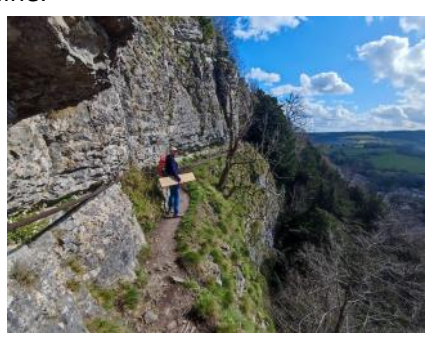
I think I might need a longer plank!!

We had a successful AGM in the evening with a fantastic 59 people attending, and we then enjoyed the excellent buffet and chat after the meeting. A full working committee was formed for