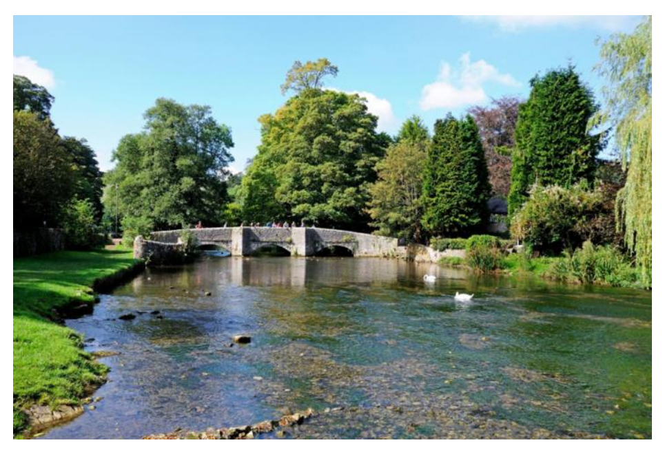
The Sheepwash Bridge (above) is a much photographed bridge in the country.

What's not to like? Come and join us for a great meet or as they said in the 60's – be there or be square!