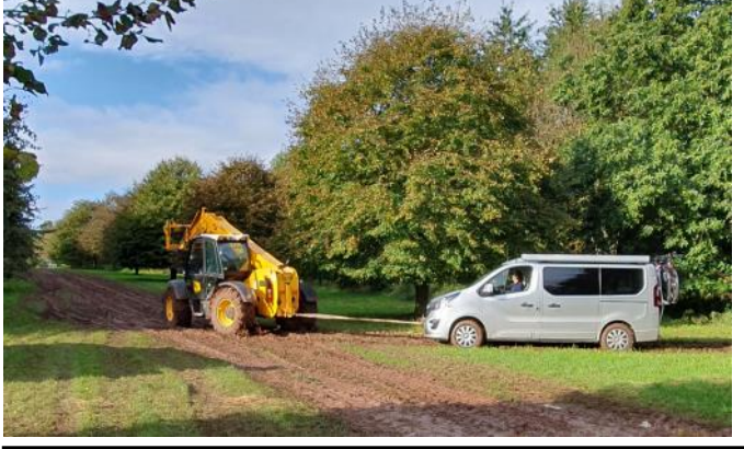
Getting towed out to go home!